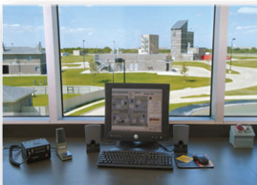
Tarrant County College Fire Technology Training Center Ft. Worth, Texas