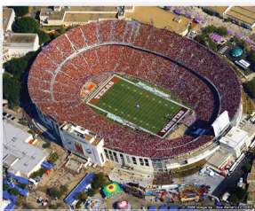
The Historic Cottonbowl City of Dallas & Stair Fair of Texas