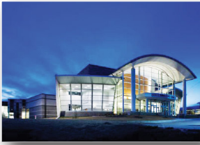
Irving ISD Jack E. Singley Academy Irving, Texas